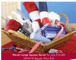
Woven Large Square Server for only $16.80! (#HH19) Regular Price $39

Host a Cooking Show in June, and receive your choice of one hot Woven Selections™ piece at 60% off!