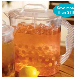
Family-Size Quick-Stir® Pitcher for only $7.80! (#HH49) Regular Price $19.50

Host a Cooking Show in July, and receive your choice of one of these great summer entertaining products at 60% off!