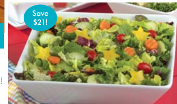
OR- Simple Additions® Large Bowl for only $14! (#HH51) Regular Price $35