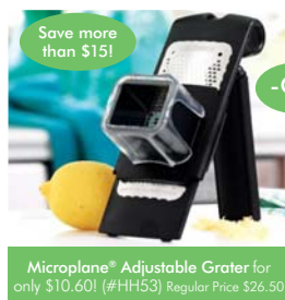
Microplane® Adjustable Grater for only $10.60! (#HH53) Regular Price $26.50

Host a Cooking Show in August, and receive your choice of one of these stainless products at 60% off!