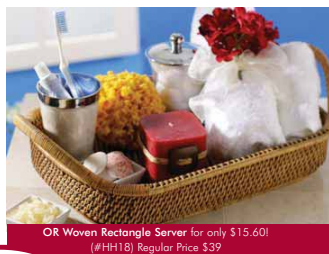
OR Woven Rectangle Server for only $15.60! (#HH18) Regular Price $39