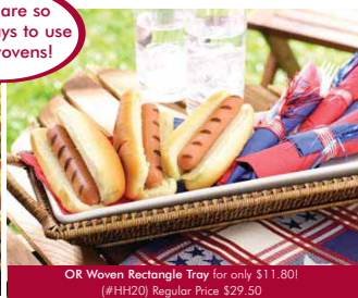
OR Woven Rectangle Tray for only $11.80! (#HH20) Regular Price $29.50

There are so many ways to use your wovens!