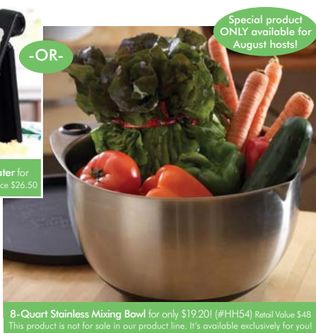
8-Quart Stainless Mixing Bowl for only $19.20! (#HH54) Retail Value $48 This product is not for sale in our product line. It's available exclusively for you!

Add the razor-sharp stainless Microplane® Adjustable Grater to your kitchen, and finely grate hard cheese, citrus rind, nuts, ginger and garlic. Or, whip up larger recipes in the 8-Quart Stainless Mixing Bowl.