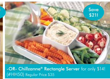
OR- Chillzanne® Rectangle Server for only $14! (#HH50) Regular Price $35